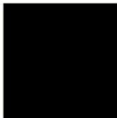
9005 black zwart